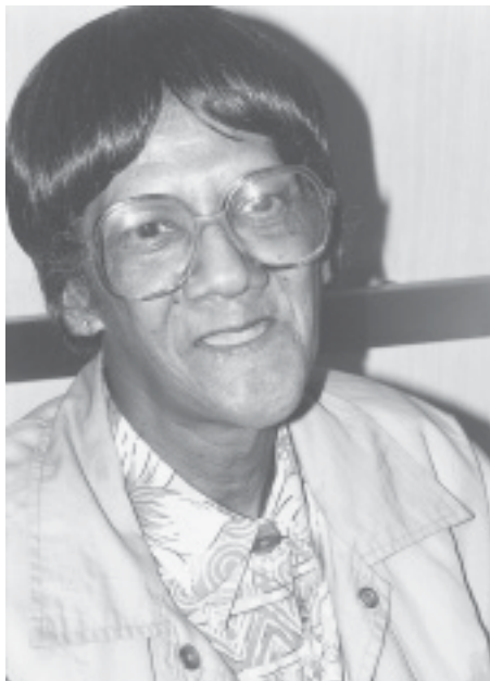
Resident of a HUD senior housing project in which Project E.D.I.E. works.

Support to provide clinical and spiritual support to cancer survivors and their families through community forums, counseling and referrals to hospitals, plus sessions to educate men and women on the early detection signs of cancer.