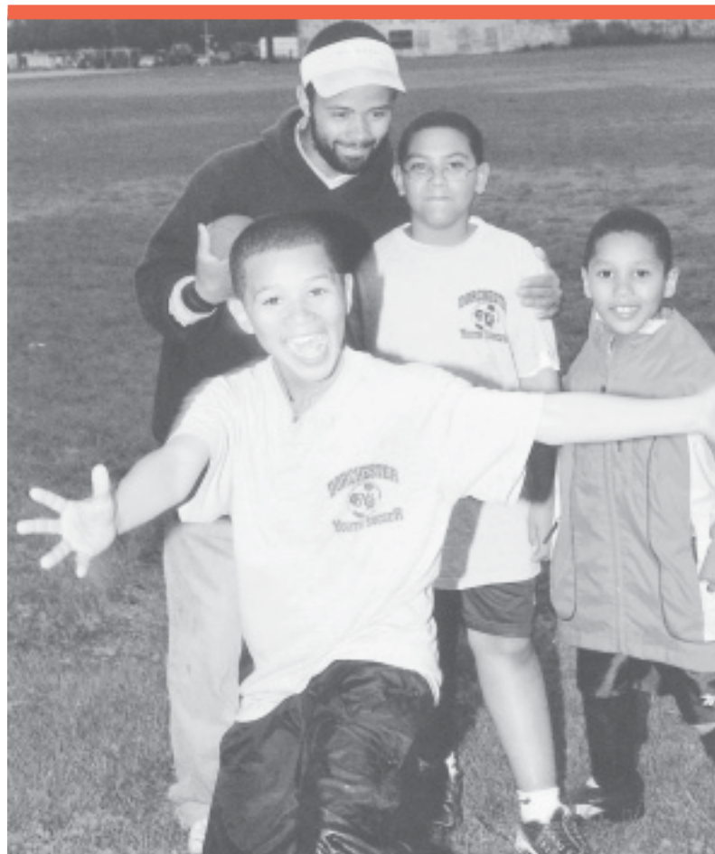
Members of the St. Patrick Youth Soccer program.

The Annie E. Casey Foundation ( aecf.org ) works to build better futures for disadvantaged children and their families in the United States. Its primary mission is to foster public policies, human service reforms and community supports that more effectively meet the needs of today's vulnerable children and families.