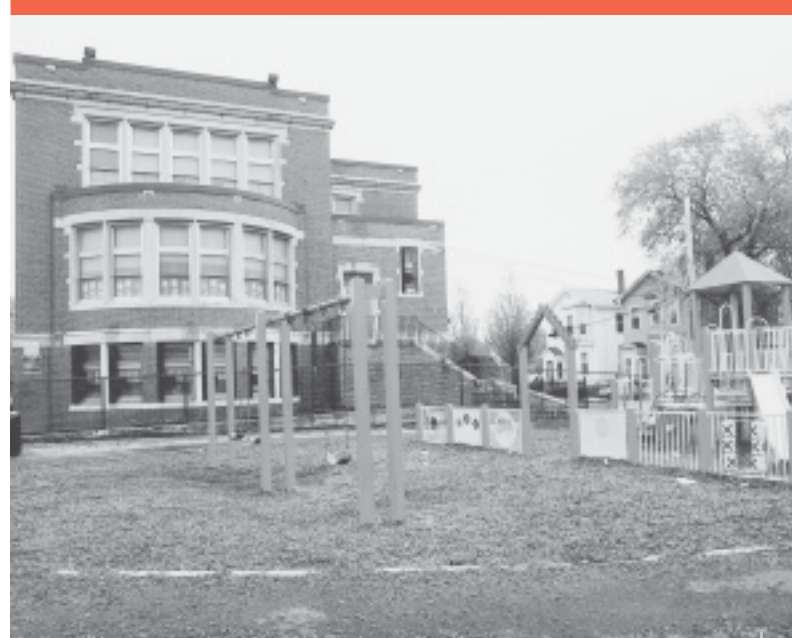
The practice of residents playing a key role in developments affecting their community is reflected in this playground at Roxbury's Emerson School. It was funded by the city's Playground Initiative, which allows residents and parents to design their neighborhood playgrounds.

Support for a series of workshops that informed community residents about specific health and wellness issues that directly affect their families.