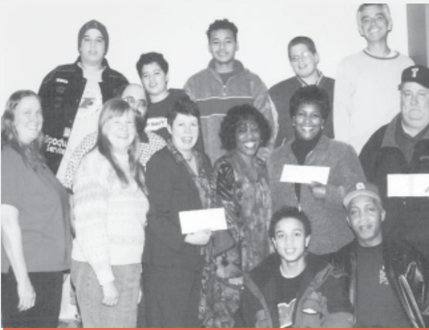
Recipients of small grants in 2002 included the Eastman/Elder Streets Crime Watch, Sisterhood on the Move and the Titans Baseball Club.

But delving into these underlying psychological and emotional issues isn’t easy, even for